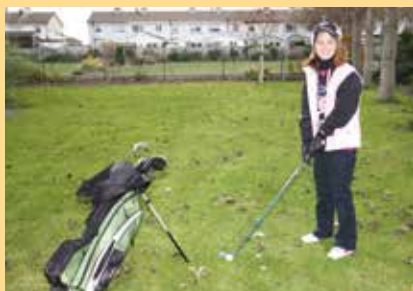
Rory McElroy watch out!

Later they visited Christchurch Cathedral and explored the medieval crypt, one of the largest in Britain & Ireland, and the earliest surviving structure in the city. A scary way to end a great night!