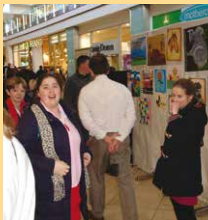
What a display!