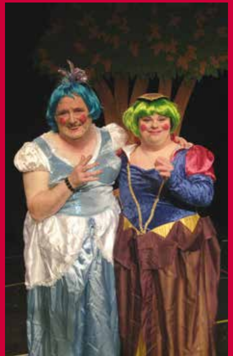
Two 'lovely' sisters!