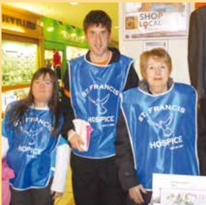
The Howth helpers