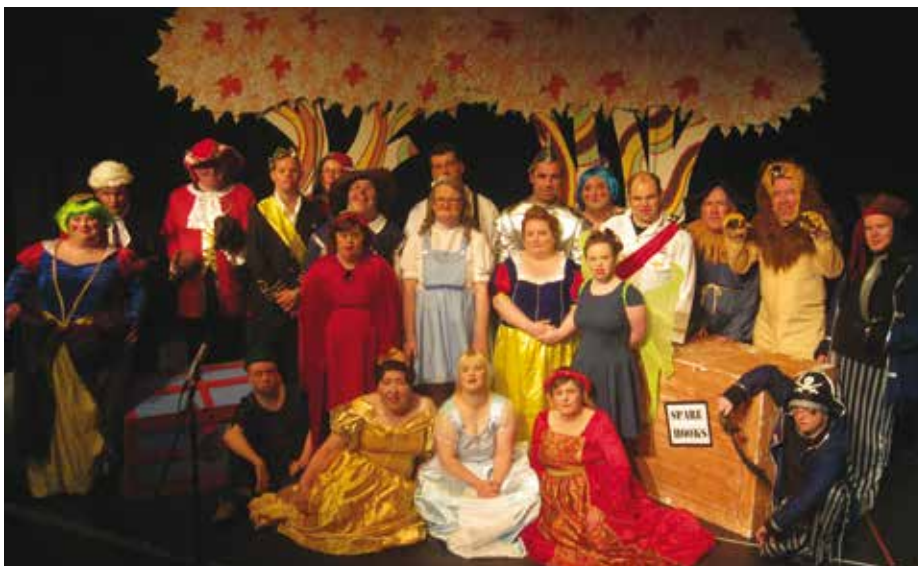
The All Star Cast

Naturally, all the actors wanted a leading role and so the script called for a cast of spectacular fairyland favourites including Snow White, Cinderella, Hook, Tinkerbelle, Prince Charming, Peter Pan, Puss in Boots, Pirates, Fairy Godmother, Tin Man, Lion, Scarecrow, Dorothy, amongst others. The costumes were colourful and flamboyant and ensured even the two Ugly Sisters were Princesses on the night!