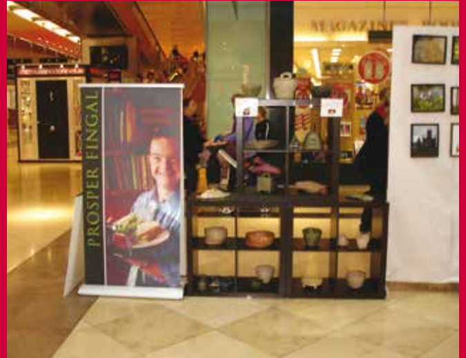
North Street at the Pavillions