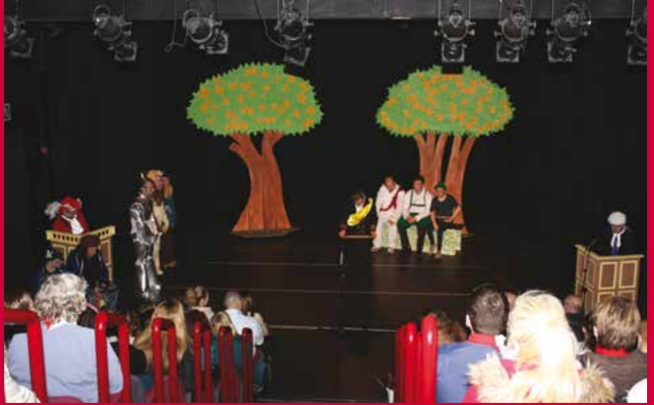
The Panto packed courthouse