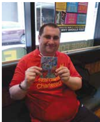
From me to you!