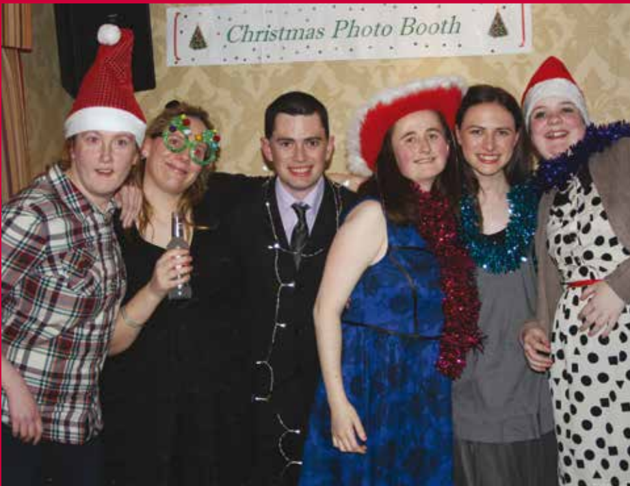
The Seatown party goes